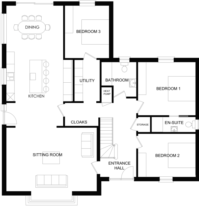
Ground Floor Layout

The Kilpatrick is ideal for those homeowners who are looking for a predominately single floor living area. It is a two-story detached home and can provide a highly customisable living environment.